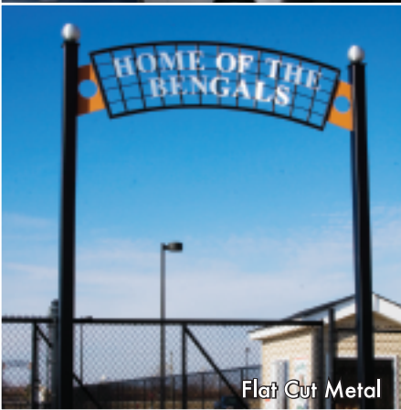
Flat Cut Metal

Dimensional letters are a great way to enhance a room or building.