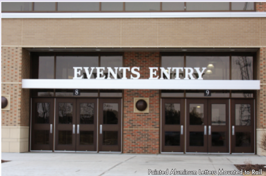
Painted Aluminum Letters Mounted to Rail